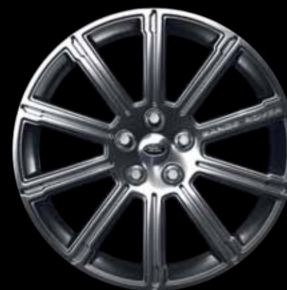
20-inch 10-Spoke Alloy Wheel (Rim only) Polished Finish* — LR017926 2010 vehicles onward

Sparkle Silver Finish — RRJ500030WYS** High Gloss Silver Finish — RRJ500030WYT**