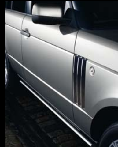
Deployable Side Steps (stowed)

*The Electronic Control Unit (ECU) and Wiring Harness must be ordered with deployable side steps.