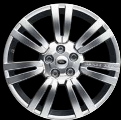
20-inch V-Spoke Alloy Wheel (Rim only) Sparkle Silver Finish* — LR008766 2010 vehicles onward

A set of striking alloy wheels for the new 2010 Range Rover can add that dash of personalization. A number of unique designs have been created to surpass the most demanding requirements while extreme winter conditions are addressed with a snow traction system.