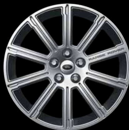
20-inch 10-Spoke Alloy Wheel (Rim only) Sparkle Silver Finish* — LR010666 2010 vehicles onward

Sparkle Silver Finish — RRJ500030WYS** High Gloss Silver Finish — RRJ500030WYT**