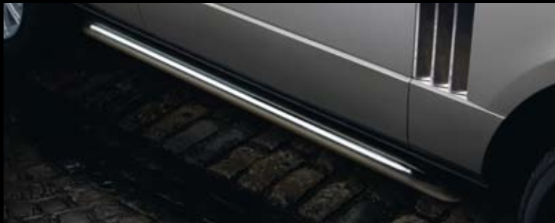
Side Protection Tubes – Stainless Steel Can be fitted with or without front mudflaps. VUB001230