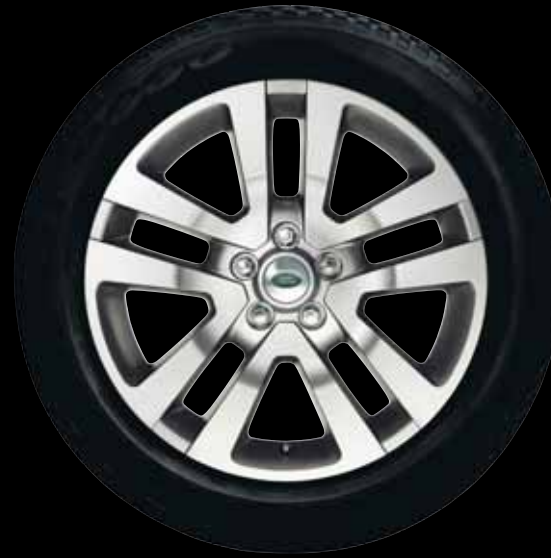
20-inch Bi-Colored Alloy Wheel (Rim only) 2006-09 gasoline and TDV8 vehicles only — LR005241

Center Cap: Bright Polished Finish — RRJ500060WYU**