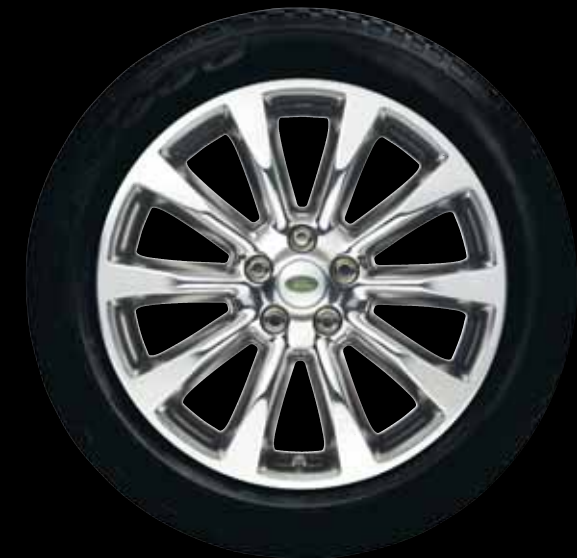
20-inch 10-Spoke Alloy Wheel (Rim only) Polished Finish — 2006-09 gasoline and TDV8 vehicles only 315MHz — RRC503940MMM

Center Cap: Bright Polished Finish — RRJ500060MUZA Bright Polished Finish — RRJ500060WYU**