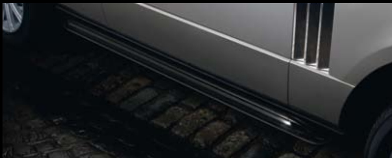
Side Protection Tubes – Black Steel Can be fitted with or without front mudflaps. VUB002510