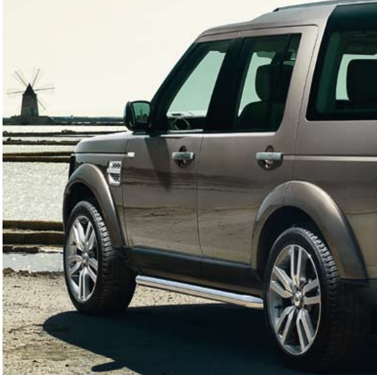
Side Protection Tubes (Stainless Steel) For 2010 vehicles onward — VTD500020