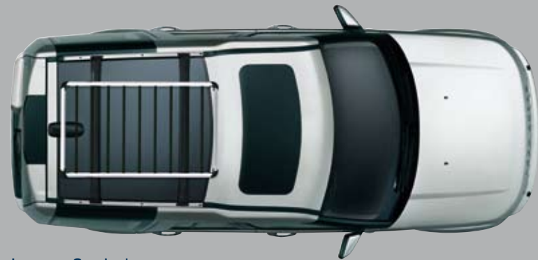
Luggage Carrier* Load capacity: 138 lbs. LR006848