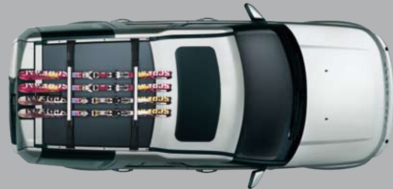
Ski and Snowboard Carrier* Lockable for security. Carries four pairs of skis or two snowboards. Incorporates slider rails for easy loading. Load capacity: 79 lbs. LR006849