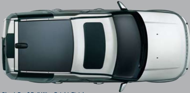
Short Roof Rail Kit – Bright Finish Designed for vehicles not fitted with factory-fit roof rails. CAP500090