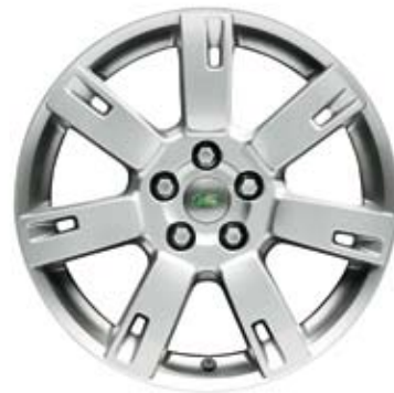
19-inch 7-Spoke Alloy Wheel (Rim only) Sparkle Silver Finish — LR008547 For 2009 vehicles onward

Center Cap Sparkle Silver Finish — RRJ500030MNM