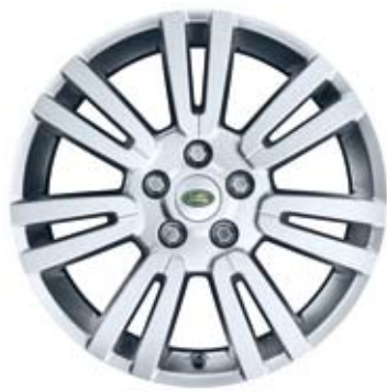
19-inch 7-Split Spoke Alloy Wheel (Rim only) Sparkle Silver Finish — LR013925 For 2009 vehicles onward