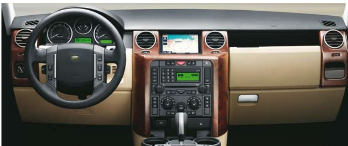
Burr Walnut Fascia Kit Comprises center console panel and air vent surrounds. For pre-2008 SE and HSE models — VUB504370