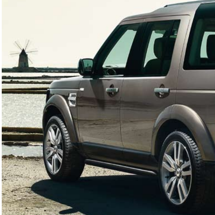
Side Protection Tubes (Black Steel) For 2010 vehicles onward — VTD500010