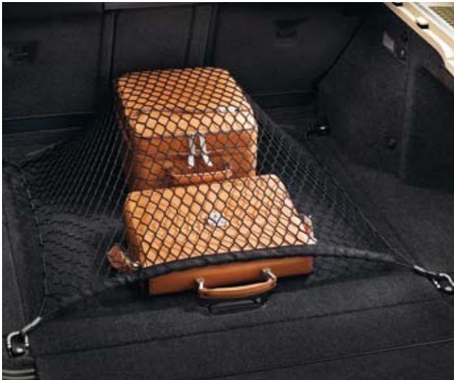
Luggage/Load Retention Net Secure items in your loadspace with a flexible Luggage/Load Retention Net. With its pair of 78" ratchet straps, it works with tie-down points on the loadspace floor to hold your cargo in place. (Pictured here in the Range Rover.) VUB503130