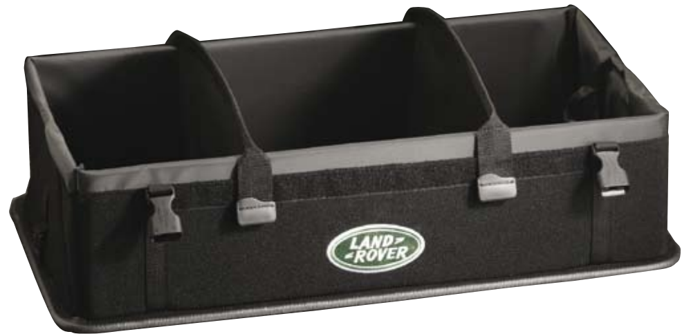
Collapsible Cargo Carrier Store items during transport with this handy Collapsible Cargo Carrier. Includes separators for added convenience. EEA500050PVJ