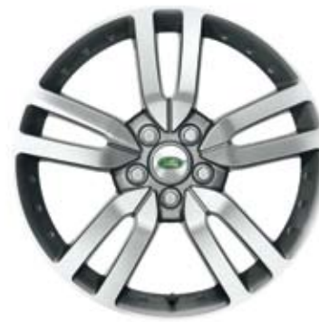
20-inch 8.5J 5-Spoke Alloy Wheel (Rim only) Diamond Turned Finish — VPLAW0002* For 2009 vehicles onward

Center Cap Sparkle Silver Finish — RRJ500030MNH