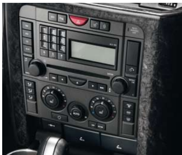
Grey Birdseye Maple Fascia Kit For pre-2008 SE and HSE models — VUB504360