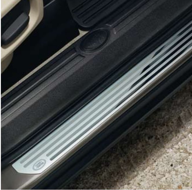
Stainless Steel Sill Tread Plate Covers front and rear door sills. EBN500041