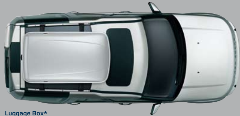
Luggage Box* Lockable for security. Opens from both sides. External dimensions: 63" long x 37½" wide x 16" high. Volume: 118 gallons. Load capacity: 120 lbs. VPLDR0003