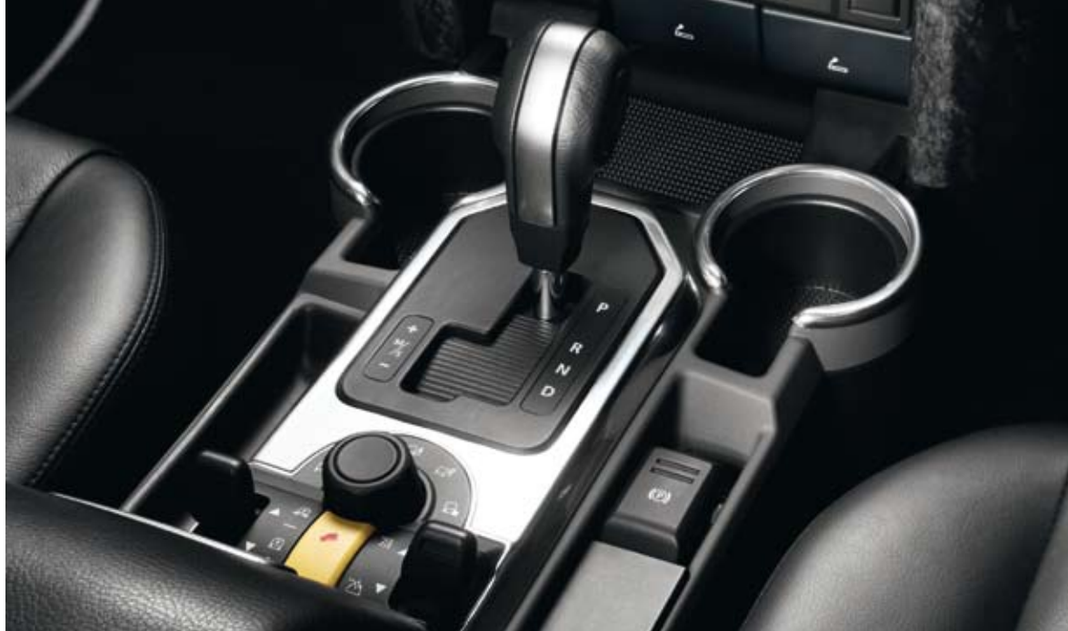
Bright Finish Gear Change and Cup Holder Surrounds For 2005-09 vehicles only — VUB501166

Your Land Rover's intuitive, sumptuous interior exudes craftsmanship and comfort. There is also the opportunity to add even more practicality with accessories such as a cargo barrier, stainless steel sill tread plates and waterproof seat covers.