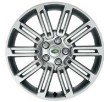
20-inch 8.5J 10-Spoke Alloy Wheel (Rim only) Titan Silver Finish — VPLAW0003* For 2009 vehicles onward

Center Cap Bright Polished Finish — RRJ500060MUZ