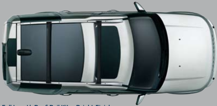
Full Length Roof Rail Kit – Bright Finish LR006442