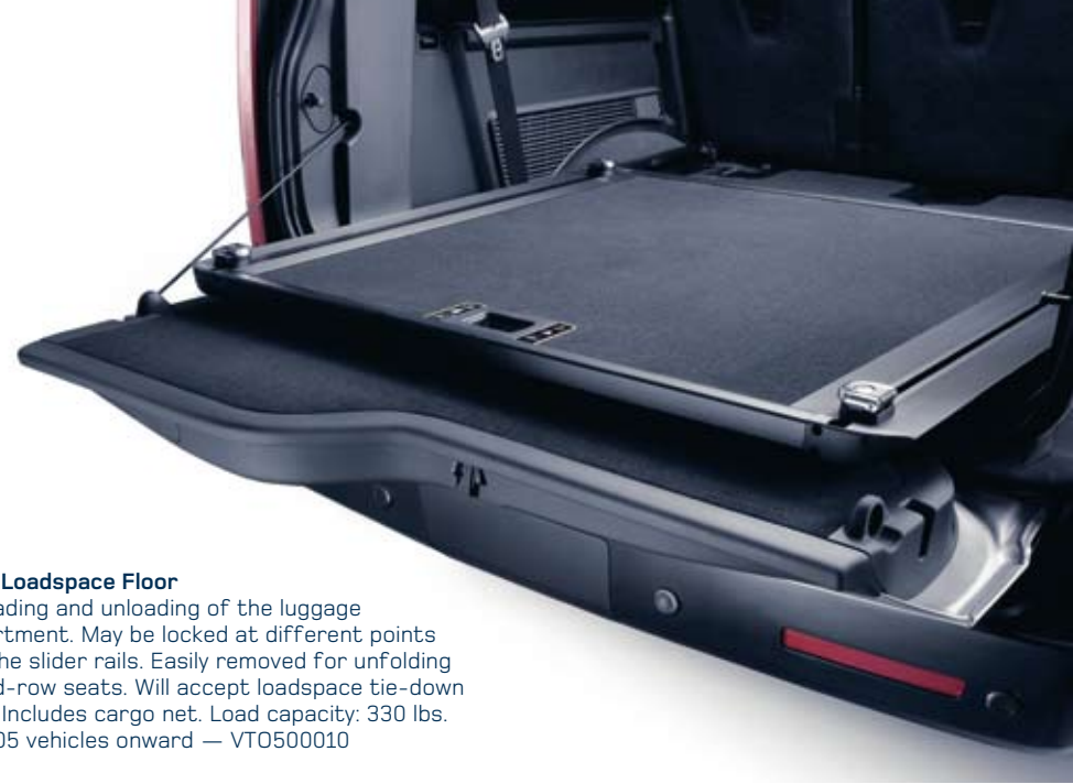
Sliding Loadspace Floor Aids loading and unloading of the luggage compartment. May be locked at different points along the slider rails. Easily removed for unfolding of third-row seats. Will accept loadspace tie-down points. Includes cargo net. Load capacity: 330 lbs. For 2005 vehicles onward — VTO500010