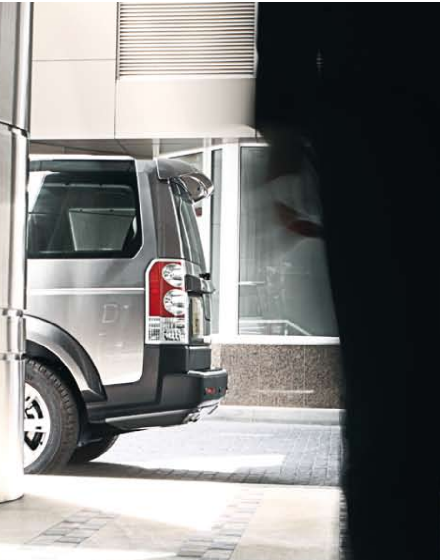
Body-Colored Tailgate Rear Spoiler (2005-09 vehicles only) Buckingham Blue — LR007577 Java Black — LR007581 Santorini Black — VPLAB0009PAB Stornoway Grey (shown here) — LR007578 Tonga Green — LR007576 Zermatt Silver — LR007580