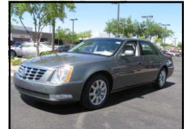
2008 CADILLAC DTS VERY LOW MILE LUXURY SEDAN #17732N $23,994