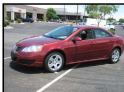
2010 PONTIAC G-6 CLEAN, LOW MILE, LOW PRICED, GM CERTIFIED #17807P $15,991