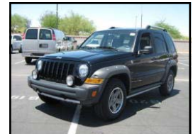
2005 JEEP RENEGADE LIKE NEW 4X4 RENEGADE #17751U $15,993