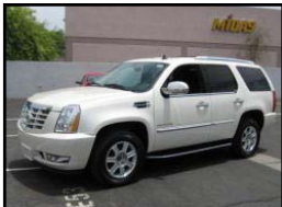
2010 CADILLAC ESCALADE WHITE DIAMOND, NAVIGATION, CADILLAC CERTIFIED, 10K MILES 17808P $51,992