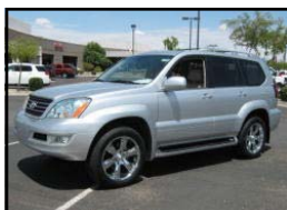
2006 LEXUS GX 470 WOW! ONLY 26K MILES, LOADED, PERFECT #17799N $32,991