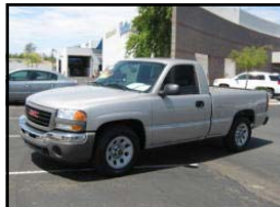
2006 GMC SIERRA GREAT WORK TRUCK #17724U $10,993