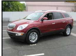
2008 BUICK ENCLAVE 17K MILES, GM CERTIFIED #17801P $29,992