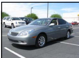
2003 LEXUS ES 300 EXTRA CLEAN LOW MILE LUXURY SEDAN #17697U $12,994