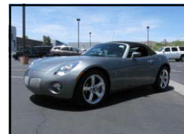
2006 PONTIAC SOLSTICE HOT SELLING CONVERTIBLE, FULLY SERVICED AND READY #17670N $12,994