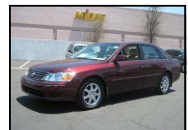
2003 TOYOTA AVALON XLS FULLY LOADED, LOW MILES, ONLY 26K #17767U $16,993