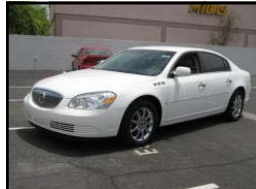
2007 BUICK LUCERNE SHARP LOW MILE LUXURY SEDAN #17806N $17,992