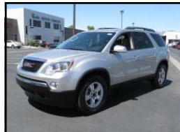
2007 GMC ACADIA VERY CLEAN & NICELY EQUIPPED #17721N $27,994