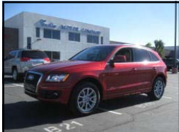
2009 AUDI Q-5 QUATTRO AWD, SHARP, 9K MILES, MUST SEE, GREAT BUY #17623N $34,994