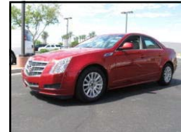
2010 CADILLAC CTS RED AND READY, LOW MILES, CADILLAC CERTIFIED #17825P $31,991