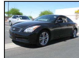
2008 INFINITI G37 JOURNEY LOADED, VERY LOW MILES, HURRY TO SEE AND BUY #17713N $24,994