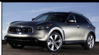
Infiniti FX50 gets 14 miles per gallon in the city and 20 miles per gallon when cruising on the highway

The Infiniti FX50 Performance Concept will be unveiled at the upcoming 2011 Frankfurt Auto Show . The FX50 packs some serious muscle under its bulging hood. The 5.0-liter V8 pumps out a very respectable 390-hp. All that power is sent through a 7-speed electronically