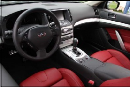
The 2011 Infiniti IPL G-Coupe comes in limited color combinations including black with an interior featuring red leather seats.

The Infiniti Performance Line represents the pinnacle of Infiniti innovation and craftsmanship. Luxury and performance are amplified in the IPL G Coupe : the exclusive IPL-tuned engine and suspension augment the driving experience while aggressive styling and aerodynamics visually express the elemental strength contained within. Building on the already impressive performance of the G Coupe's 3.7-liter 24-valve V6 engine, the IPL G Coupe has been tuned to produce more torque and an additional 18 hp. IPL enhancements intensify the feel of acceleration,