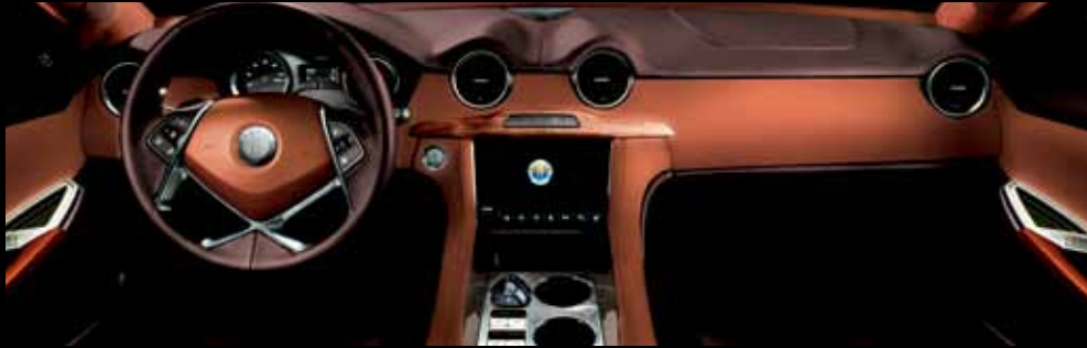
• Canyon Tri-Tone™