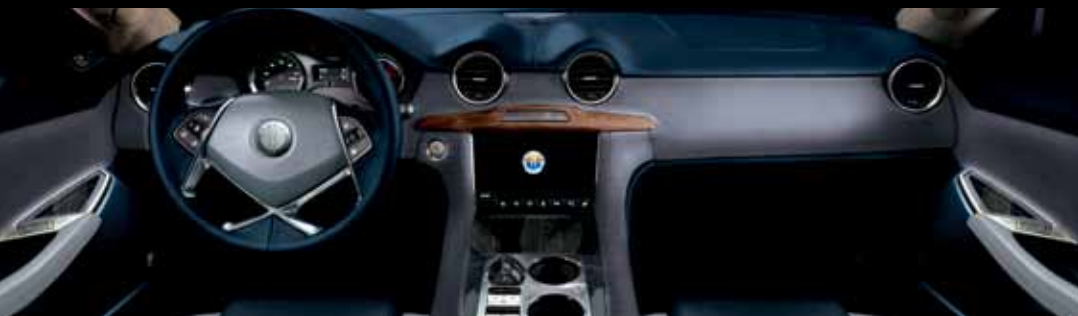
● Glacier Tri-Tone™