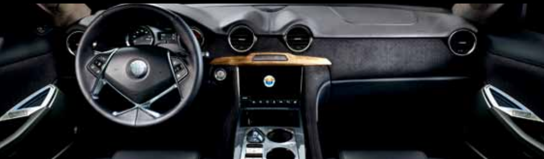
● Black Sand Monotone™