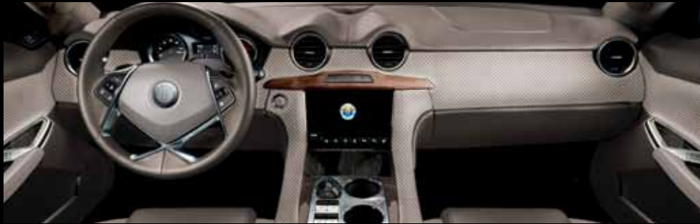
• Earth Tri-Tone™