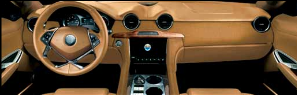
• Dune Monotone™