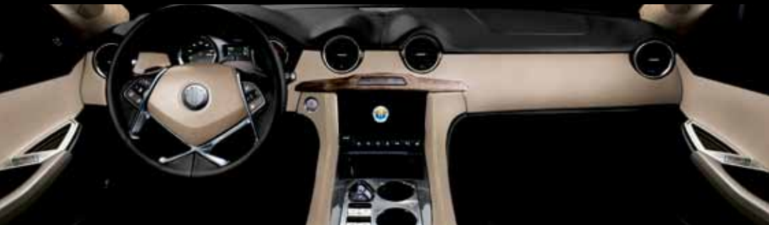
● Monsoon Tri-Tone™